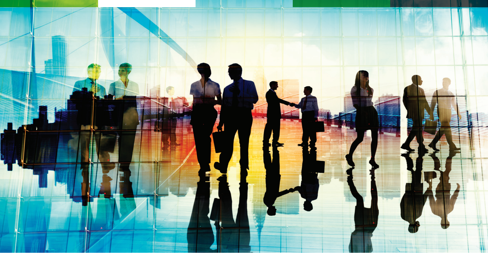
Exhibit and Sponsorship Opportunities

Marketplace Trade Show – NAPEO’s Flagship Event | Imagine the business opportunities available when a thousand decision-makers from the PEO and HR outsourcing industry gather under one roof. Join NAPEO as an exhibitor at NAPEO’s Marketplace 2023 and capitalize on the opportunity to meet face-to-face with PEO professionals eager to expand their service offerings.